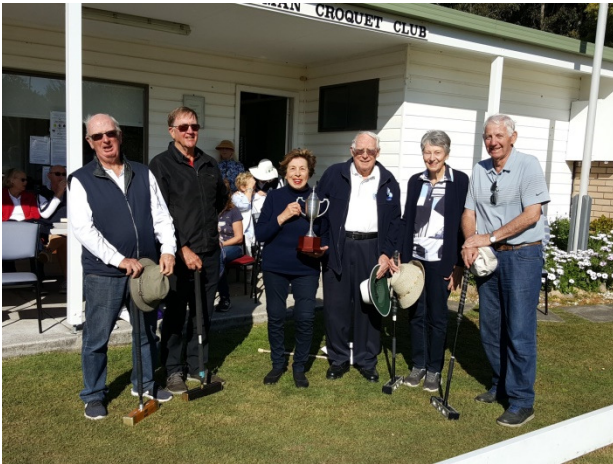
Viewing the Gibson Trophy, before Finals play-off

The inaugural Gibson Trophy was held over the weekend 17-18 August, as was hailed as a great success! There were 24 entrants from all different levels across the club. Participants were divided into four blocks of six, ranked according to their GC handicap, and played level singles games. After everyone enjoyed a sausage sizzle lunch, the winners of each of the four blocks played-off in semi-finals, and then finals, playing extra turns according to their handicaps.